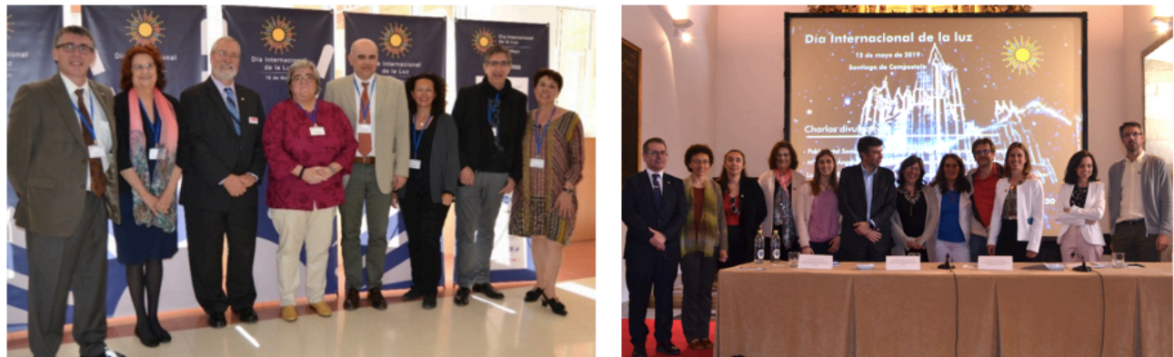
Figure 3. Pictures of some of the organizers and participants at the Central Flagship Event in Spain of the IDL in 2018 (left) organized at Universidad Complutense de Madrid and in 2019 (right) at Universidade de Santiago de Compostela.

A major central flagship event for the IDL has been organized every year in Spain. The first one, in 2018, was organized at the Faculty of Physics of the Universidad Complutense de Madrid (UCM) [5]. The second one, in 2019, was organized at Universidade de Santiago de Compostela (USC) [6]. These events are becoming well-established ones for the Optics & Photonics community in Spain. Figure 3 shows some pictures at the end of the events in Madrid (left) and in Santiago de Compostela (right). Both events included several conferences by relevant invited speakers as well as other parallel activities like exhibitions, demonstrations for students and others. A detailed description can be found in [5,6], and the talks are available online at [7,8] respectively.