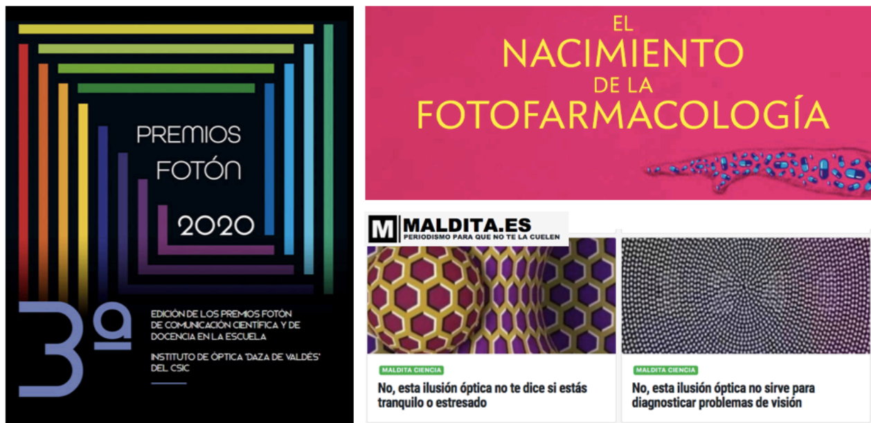
Figure 5. Left: Announcement of the 2020 PHOTON Awards by the Institute of Optics-CSIC. Right Top: Detail of the cover page of the publication “The birth of the Photopharmacology”, first prize of the 2020 EMITTED PHOTON award. Right bottom: detail of the webpage Maldita Ciencia ( https://maldita.es/malditaciencia/ ), second prize of the 2020 EMITTED PHOTON award.