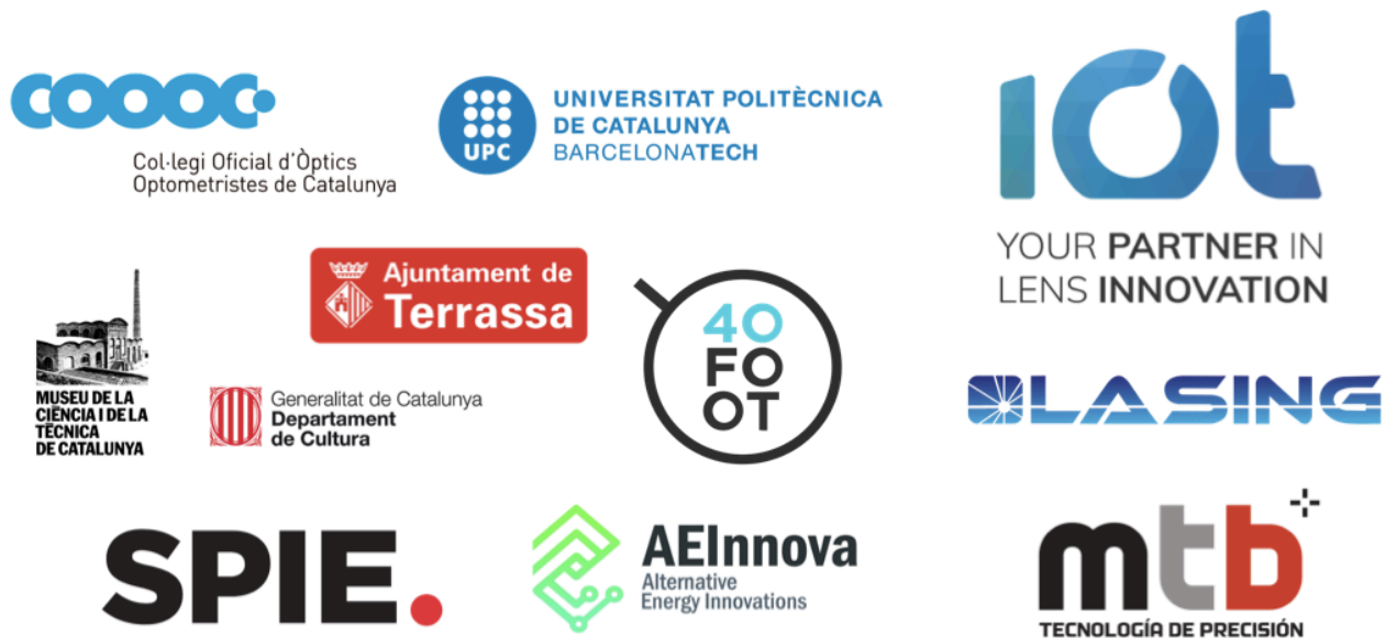
Fig. 2. Organizations supporting the 2020-21 flagship event of the IDL in Spain and sponsoring the Spanish Committee for the IDL.